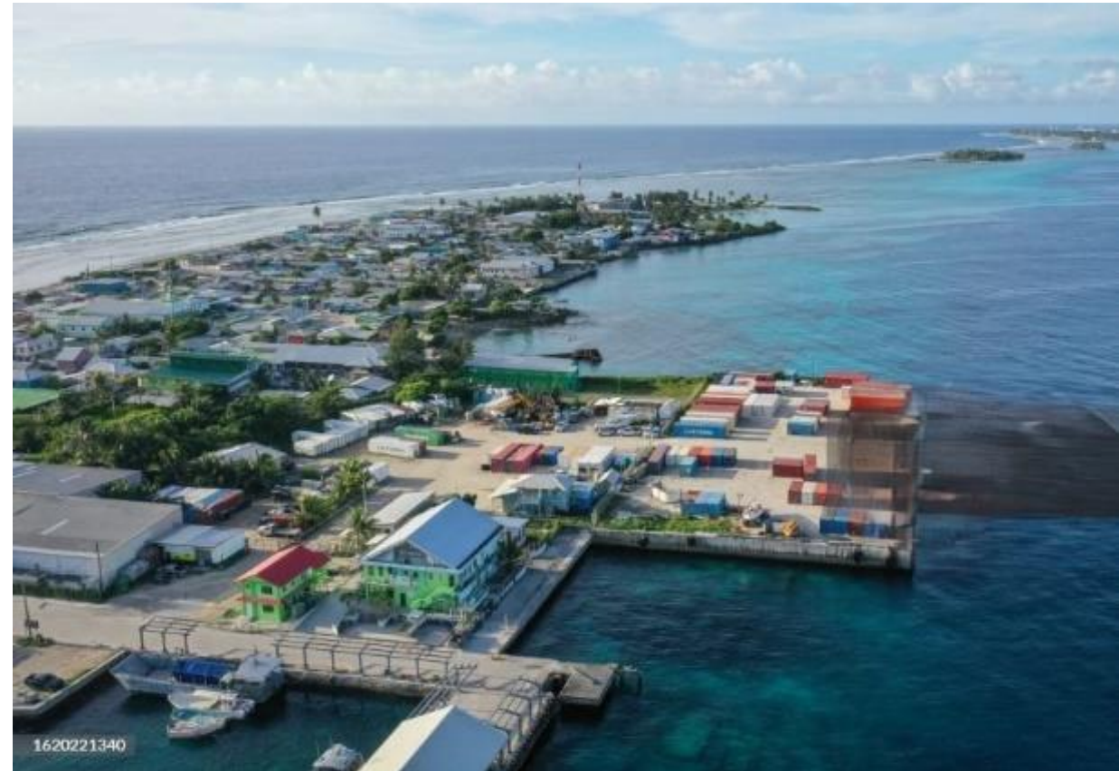
Ebeye Port/Kwajalein Atoll